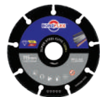
Braze Diamond Multi Cutter