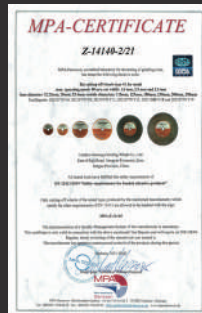
MPA – Hannover