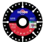
Braze Diamond Long Life Cutter