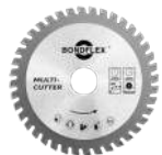
TCT Multipurpose Cutter