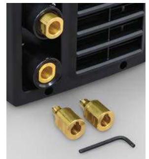
CST 282 with Tweco-style receptacles shown.

Universal connector system allows the machine to be quickly configured to either Tweco®- or Disne-style receptacles. Extra receptacles and wrench shown are sold separately as Universal Connector Kits (see page 4).