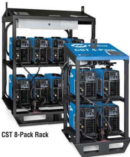
CST 8-Pack Rack