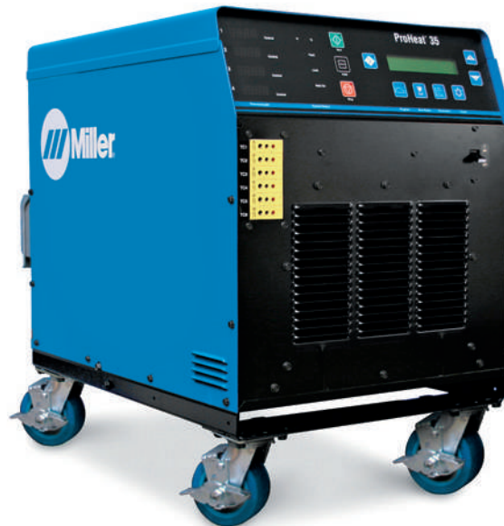
ProHeat 35 power source shown with optional running gear (195436).

Designed with flexibility and efficiency in mind, the air-cooled cables can be wrapped into coils of various shapes and sizes to fit almost any induction preheating application, without the need for cooler and coolant. For temperatures up to 392 degrees Fahrenheit (200°C).