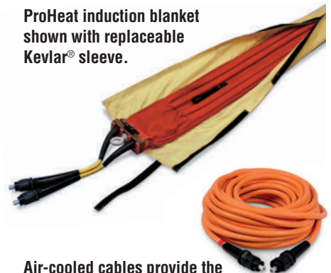
ProHeat induction blanket shown with replaceable Kevlar® sleeve.