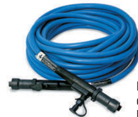
ProHeat liquid-cooled induction heating cable.

Improved working environment is created during welding. Welders are not exposed to open flame, explosive gases and hot elements associated with fuel gas heating and resistance heating.