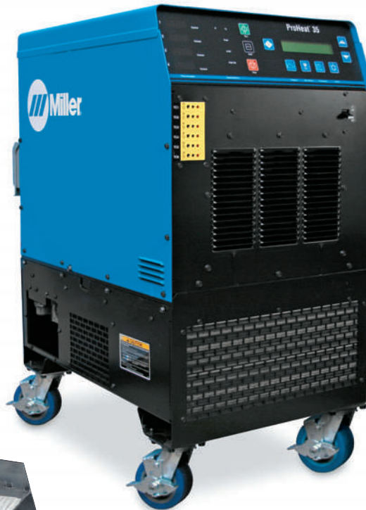
ProHeat 35 power source shown with heavy-duty induction cooler (951686) and optional running gear (195436).